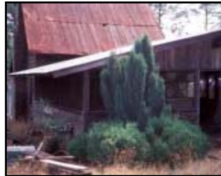
Air out cabins