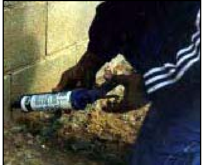
Seal holes with caulk